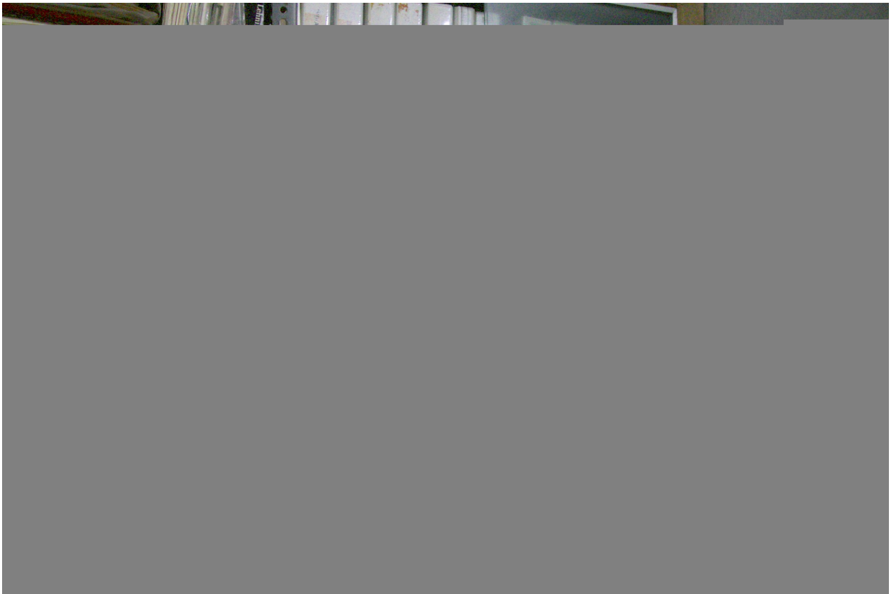
The Volunteer Archivists

Shaunak Sen's debut film Cities of Sleep is set in the capital, New Delhi, following the lives of the urban poor – the homeless and migrants – who sleep on the streets. The stories of these people are never talked about unless there is an accident of drivers killing the sleeping people on the roads. The film brings out the politics of sleep and how it is controlled by the sleep mafia who charge homeless families to sleep in shelters and even on pavements. Several of these shelters are brimming with people who are in need of a bed to rest during harsh winters and heavy monsoons.