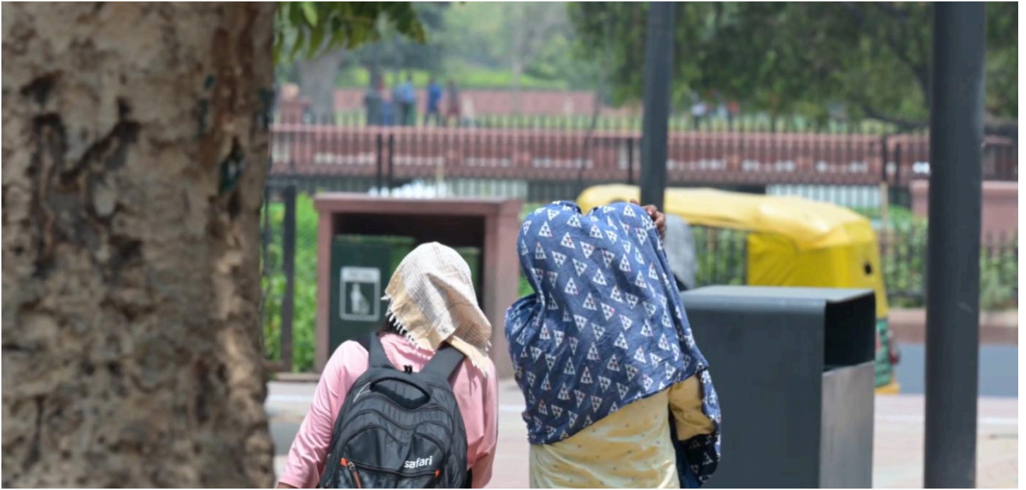
People cover their heads in Delhi's heatwave (May 2024)