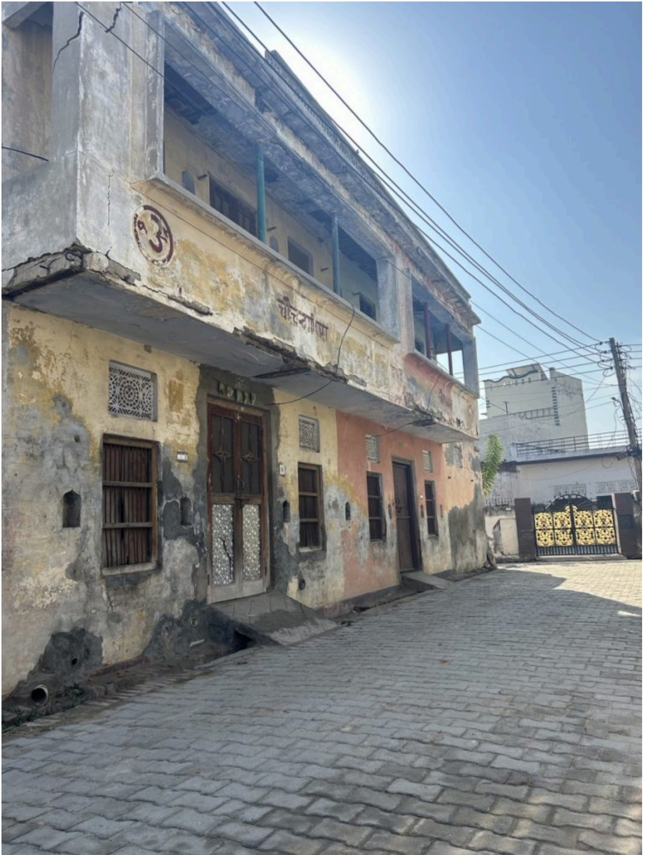
Jagdishpur village in Sonipat.