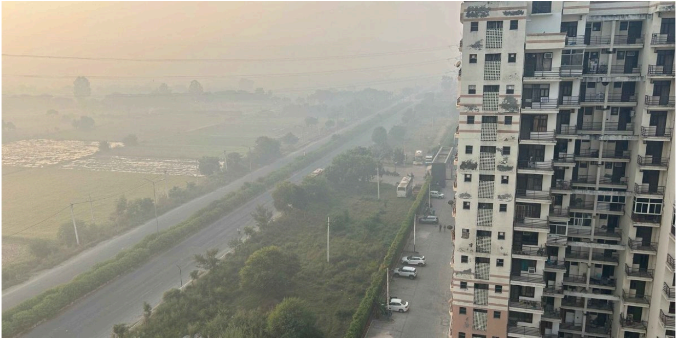
Max Heights Housing Society in Sonapat.

thewire.in/gender/between-progress-and-patriarchy-gender-dynamics-in-sonipats-transformation