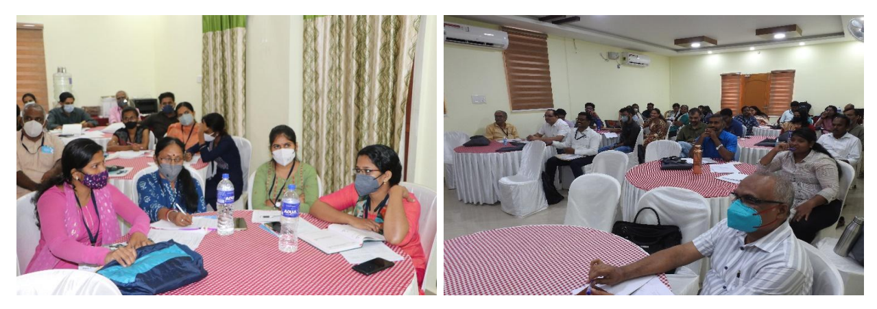
FIGURE 4. Participants at the State and National level training sessions.