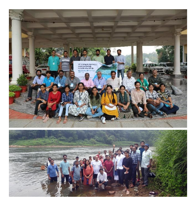
FIGURE 6. Participants in the two-tier training sessions.

valleys are under the Government of India's control and Parliament can declare it by law. The rules for managing interstate rivers are