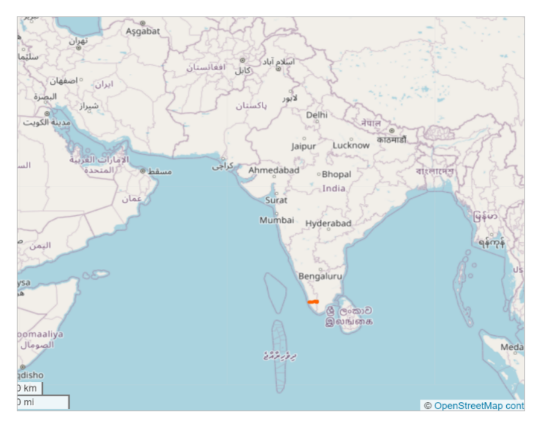
FIGURE 1 . Pampa River, Kerala State, India – The red mark indicates the position (A detailed map is available at: https://www.openstreetmap.org/relation/15461371#map=4/19.08/83.23).

management and evaluate the effectiveness of subsequent management actions.