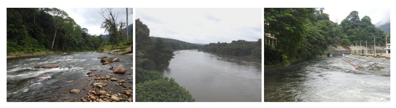
FIGURE 2. Pampa River - Views from different locations.