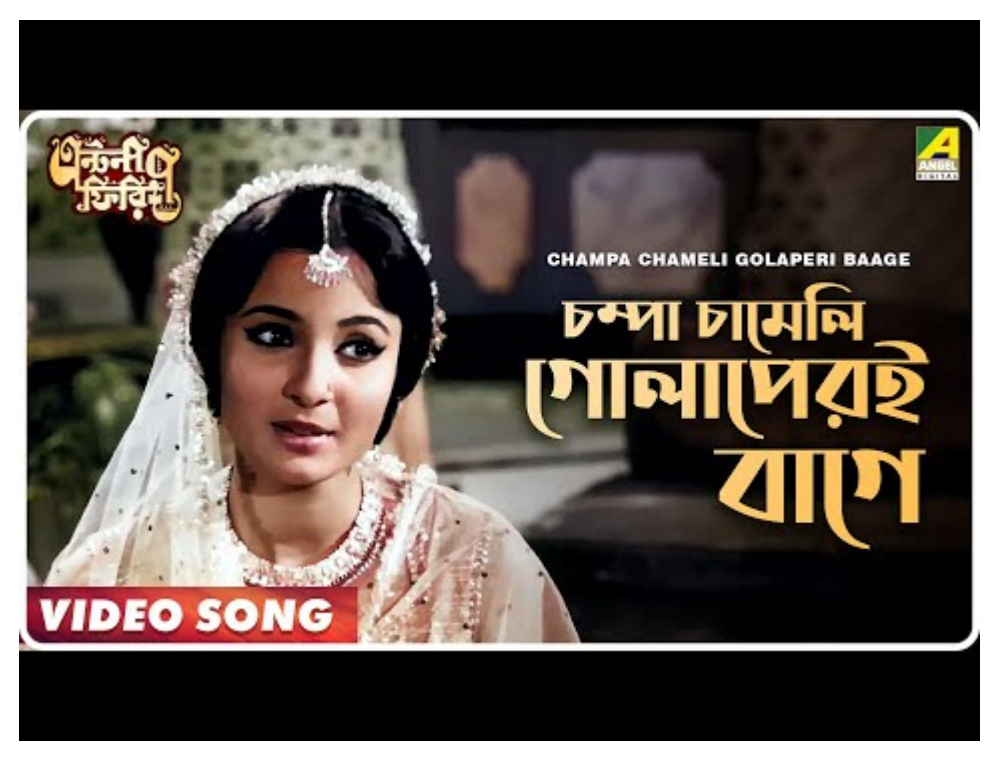
Watch Video At: https://youtu.be/7qezsSLee08

'Champa Chameli Golaperi Baage', a song from 'Antony Firingee'.