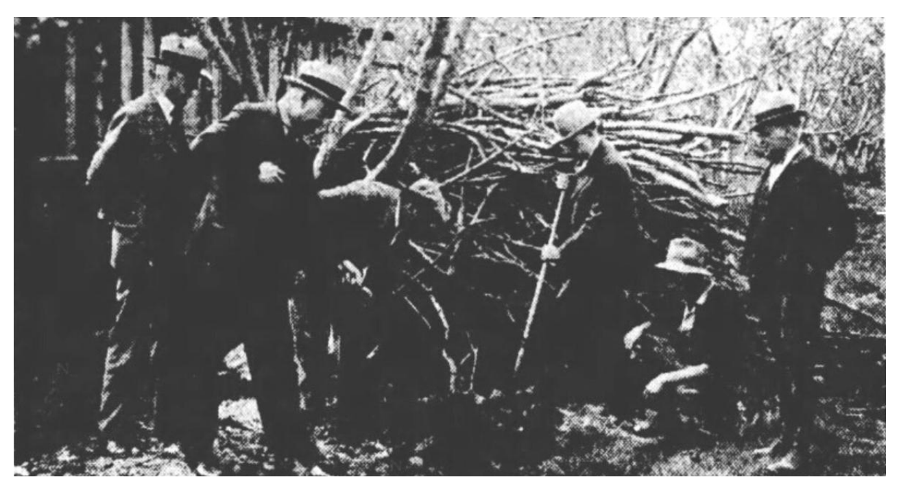
Officers digging on the Switzer Ranch near Wheatland, California for clues to the "Hindu murders" in 1931.

On March 4, 1931, newspapers in California's Central Valley region reported the discovery of a body near the town of Rio Vista. The body found nude and headless – clearly decapitated – had been trussed with steel wire and bound to a tractor wheel. It was found in the Cache Slough area, a wetland region in the Sacramento-San Joaquin Delta region.