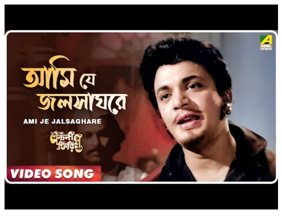
Watch Video At: https://youtu.be/nge2hWSQyEc

'Ami Je Jalsaghare', a song from 'Antony Firingee'.