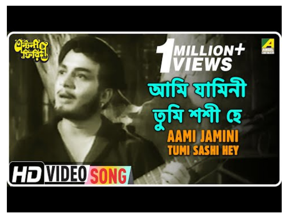
Watch Video At: https://youtu.be/NUu7xUxYnn0

'Ami Jamini Tumi Shashi Hey', a song from 'Antony Firingee'.