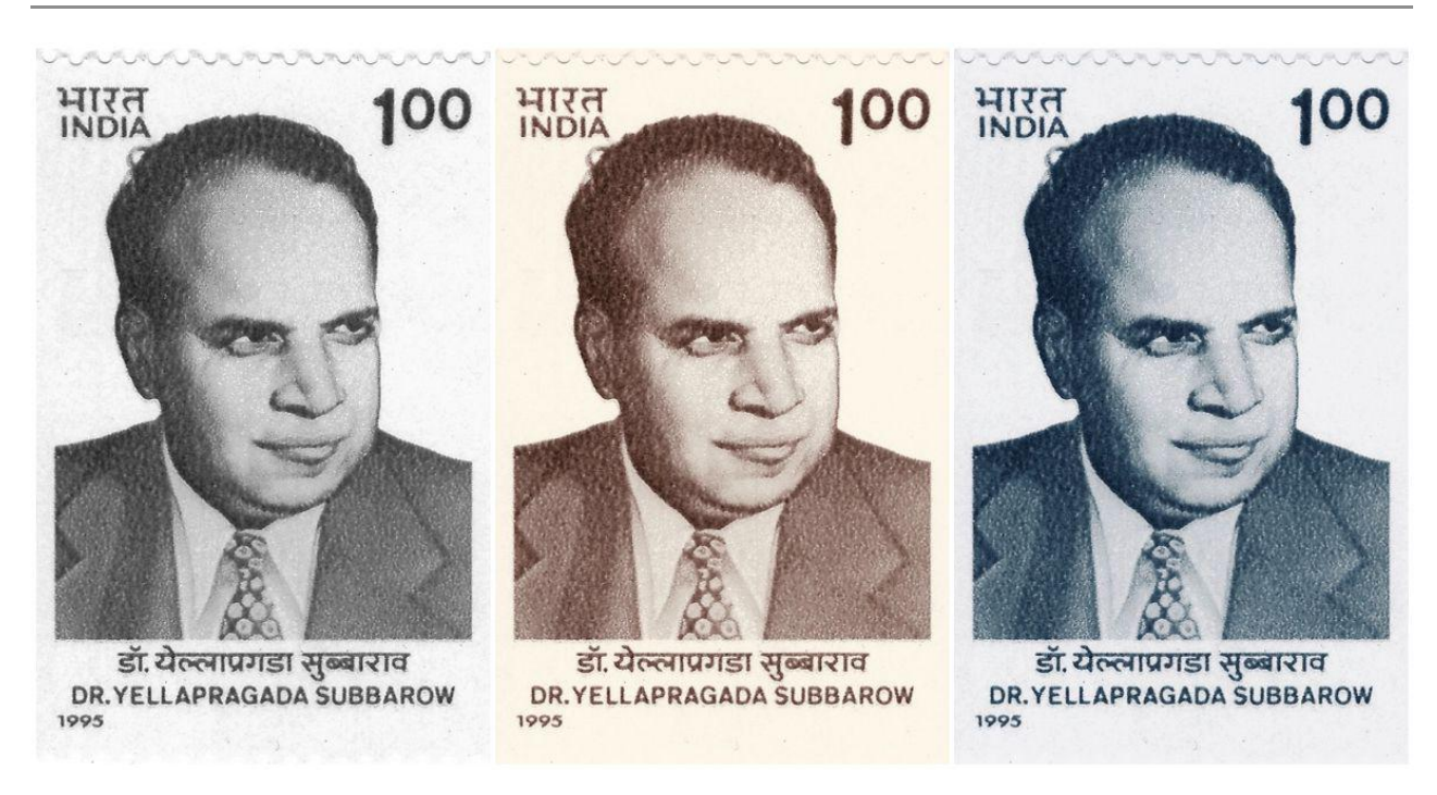
Yellapragada Subbarow

Yellapragada Subbarow's research didn't earn him fame. But it did secure his place in history.