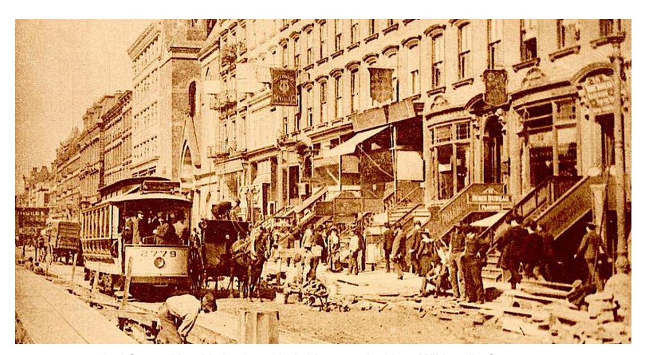
42nd Street, New York, circa 1880.

In the 19th century, two Indians travelling through the United States forty years apart had near identical experiences of what it was to be an alien.