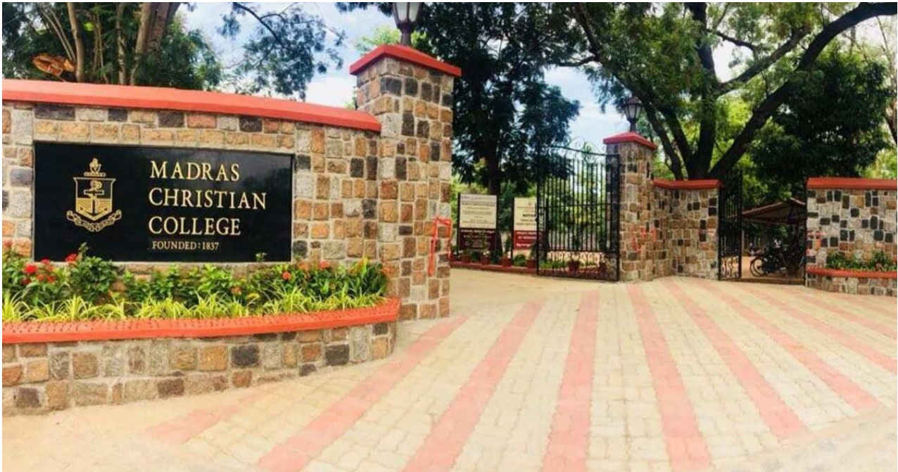
Madras Christian College, Chennai.

There are various types of stories which are frequently associated with educational institutes like colleges and universities. Thousands of pupils come in every year to study, to progress towards achieving their dreams, and they graduate after completing their education. The unspoken stories remain scattered across classrooms, corridors, canteens, libraries, and reading rooms. The primary difference between workplaces and educational institutes is that unlike workplaces, the faces around the campus change every year and the characters in the story are more numerous and diverse. Every institute has their own sad stories, funny tales, and gossips with a bit of both.