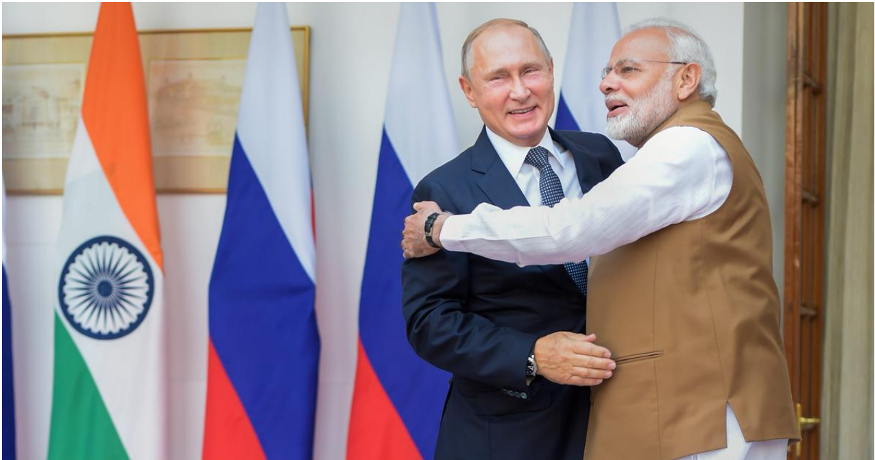
Prime Minister Narendra Modi with Russian President Vladimir Putin in New Delhi in this photograph from 2018.

After over a year of the Ukraine war, efforts at building a global consensus against Russia seem to have stalled, with many countries opting for neutrality.