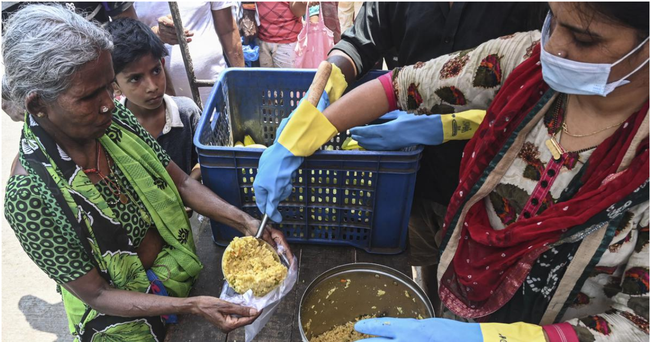
A volunteer from a non-profit distributes food in Mumbai during the Covid-19 lockdown.

Shortly after the Rajasthan government passed its Right to Health Act last month, economist Aravind Panagariya, who served as the first vice-chairperson of the government think tank Niti Aayog, launched a blistering critique against the state's " populist " policies.