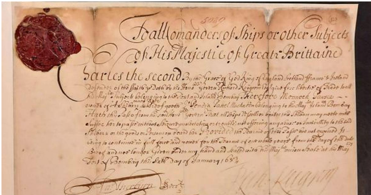
British Library IOR/E/3/43 f. 323 (Public Domain)

A pass for 'Monnock Parsee' and 'Pendia Pattell' sailing aboard the Tiger was issued at Fort Bombay carries an impression of the 'Union Seale'.