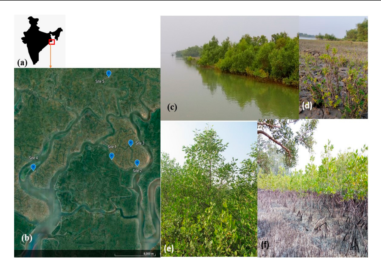
Figure 1. The study site. ( a ) From map of India, the study area has been zoomed out to represent all the sampling sites in a google earth image. ( b ) Imagery of the study site locating the sampling metapopulations. ( c ) Site-2 (S2) dominated by A. marina strands. ( d ) Site-5 (S5) metapopulation dominated by halophyte- S. maritima . ( e ) Site-3 (S3) dominated by A. marina-S. caseolaris association and ( f ) Plantation site with establishment of R. mucronata strands.

Table 1. The location and description of the study sites/metapopulation.