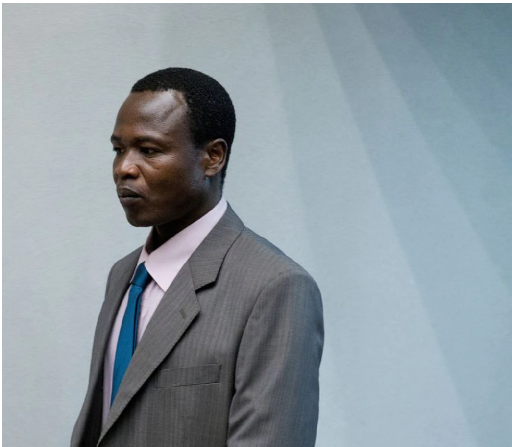
Dominic Ongwen, a former senior commander in the rebel Lord's Resistance Army, enters the hearing room at the International Court in The Hague, Netherlands, December 6, 2016.

Significantly, over 4,000 victims and survivors were allowed to participate in the trial, represented by three teams of legal representatives.