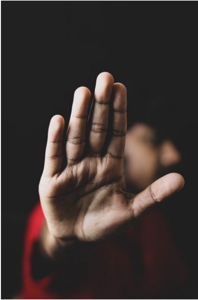
Representative image.

violence against men and boys, as well as transwomen, in conflict and post-conflict situations, including in Syria .