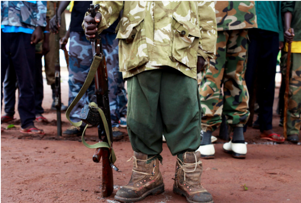
A former child soldier holds a gun as they participate in a child soldiers' release ceremony, outside Yambio, South Sudan, August 7, 2018.

Among them, the girl child soldiers were considered as “trophies” for good behaviour by male soldiers (leading to their “marriage” to them), and girl soldiers were often recruited in order to provide sexual services to them. The judgment is a landmark one on child soldiers.