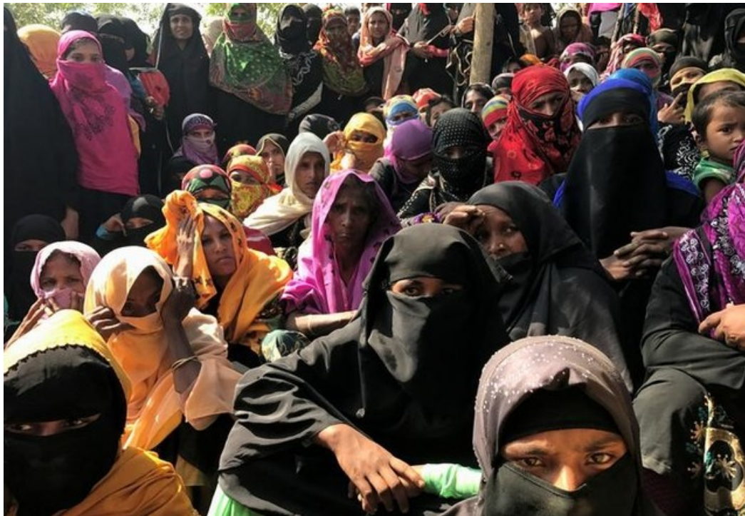
Rohingya refugee women wait to collect relief vouchers at Kutupalang Unregistered Refugee Camp in Cox's Bazar, Bangladesh, February 27, 2017.

In 2019, a UN Independent International Fact Finding Mission found that Myanmar's military used sexual and gender-based violence to terrorise and punish ethnic minorities – the Rohingyas. They inflicted such violence on women, girls, men, boys and transgender people. Hopefully, the ICC prosecutor will draw upon such reports during the ongoing investigation into Myanmar.