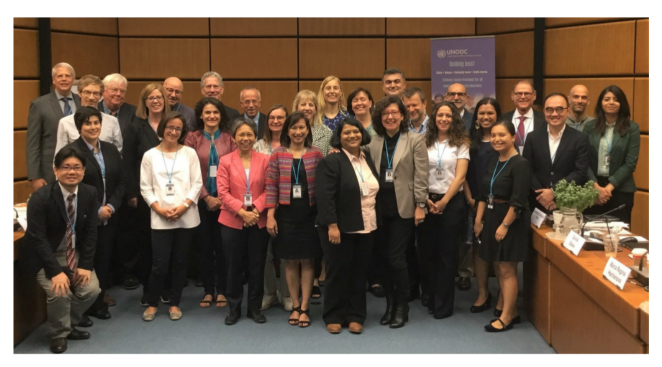
Participants at the UNODC Technical Meeting "Elements of Family-based Treatments for Adolescents with Drug Use Disorders: Creating Societies Resilient to Drugs and Crime," in early June 2018, at the United Nations Office in Vienna.