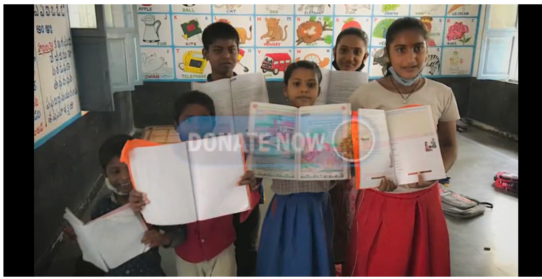
Without at least one wholesome meal a day they're at risk Akshaya Patra | Sponsored

Biryani by Kilo - Free Phirni Biryani by Kilo | Sponsored