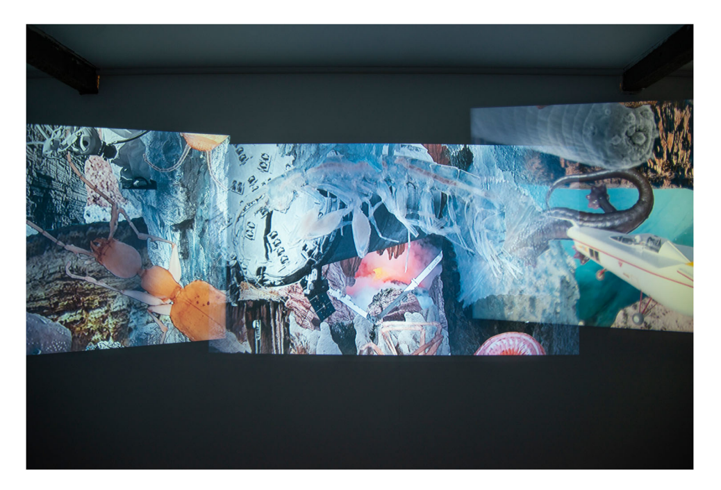
Figure 5. Installation view of A Millennia of Seepage in Whoever's is the Soil, shown at STABLE Artspace Brisbane, 2021.

While not directly interacting with the earth as a medium, this burgeoning arts practice is nevertheless in line with eco art conversations that posit that 'because environmental problems are rooted in cultural practices and ideologies, it is artists, immersed