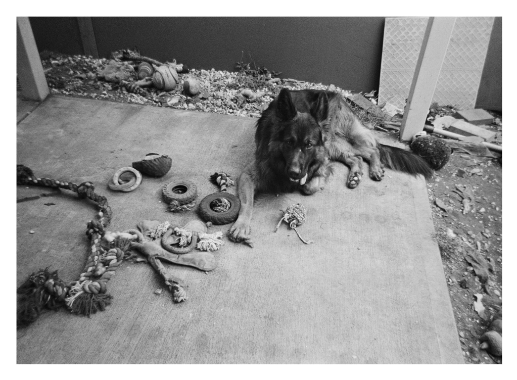
Figure 3. 'Asta', 2020. Source: Photo courtesy of Jasmine Hair for the 'Engaging Youth in Regional Australia' project.

myriad imprints on memory, I reflect on the how creating/doing art catalyses finding one place in another.