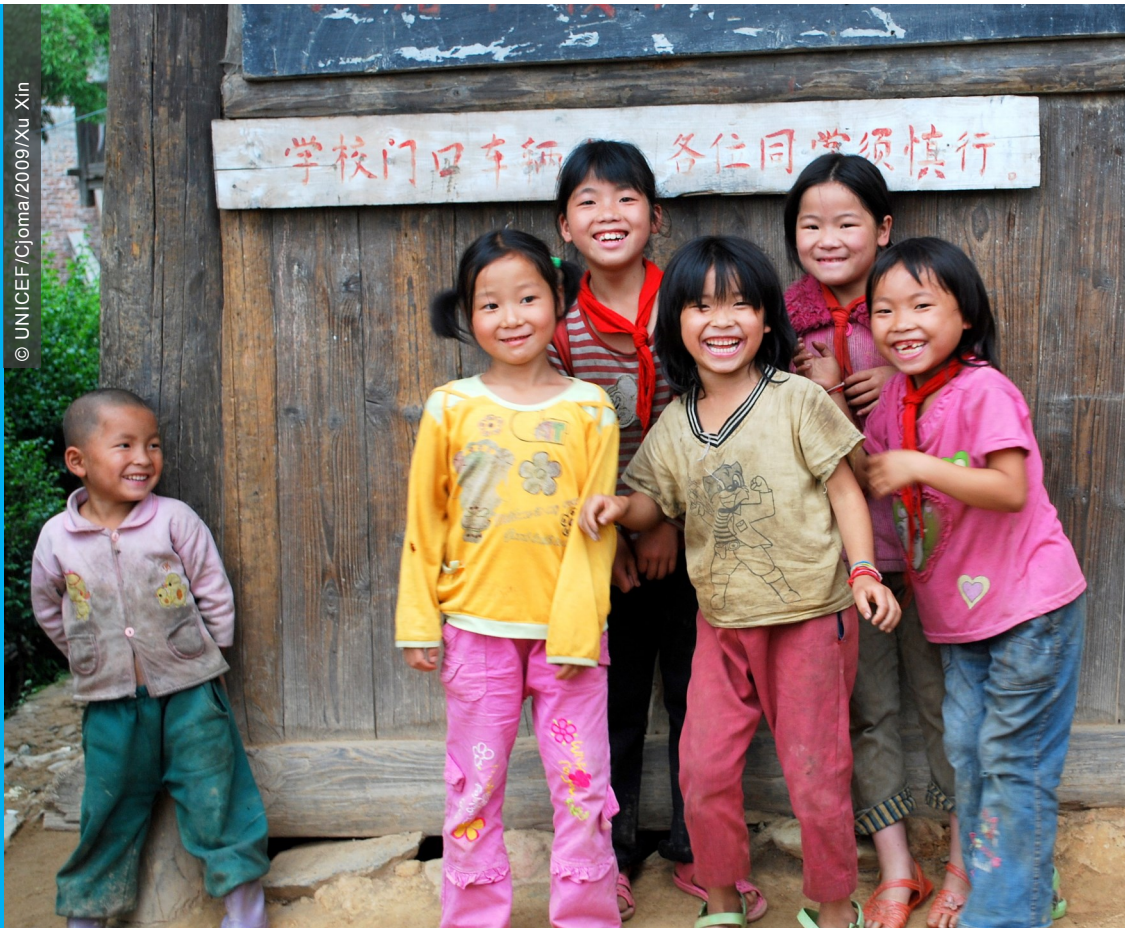
Children from a Child Friendly School in Sanjiang County, Guangxi Province

children are facing more challenges, experiencing more educational vulnerabilities such as inaccessibility to schools, repeated school transfer and immature dropout. They are also more prone to accidental injuries, child-trafficking, sexual abuse, family violence and tense parent-child relations, leading to children running away from home, developing deviant behaviors or even committing crimes. The government has made some efforts to address challenges of rapid industrialization and urbanization affecting the rights of children. We are also clear that it is not easy to fairly and equally safeguard the rights of these children under the current urban-rural divide. But, it is believed that the government can devise more prospective policies and develop more targeted and effective mechanisms for services to guarantee the rights of these children.