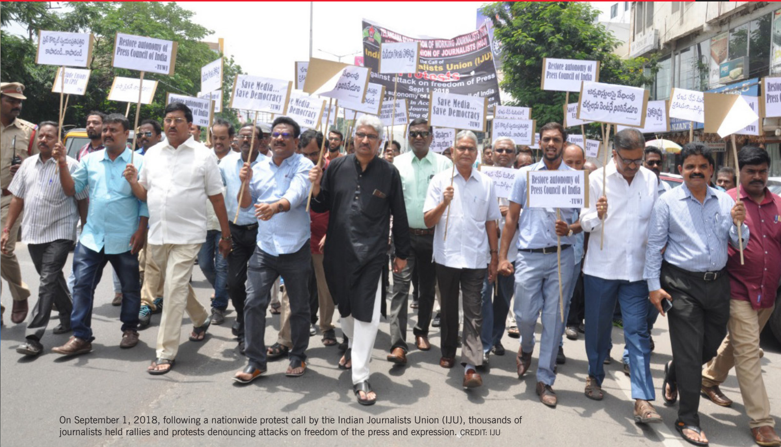
On September 1, 2018, following a nationwide protest call by the Indian Journalists Union (IJU), thousands of journalists held rallies and protests denouncing attacks on freedom of the press and expression.

detained in October by the Chhattisgarh Police for eight hours in Narayanpur in Bastar district without any specific charges and released only after their phones were checked and memory cards copied. Following a pattern of ever-rising attacks on journalists by both the state and non-state actors, the IJU and the National Union of Journalists India (NUJ I) have been demanding enactment of a safety law from the Central Government. The Maharashtra government already has one in place.