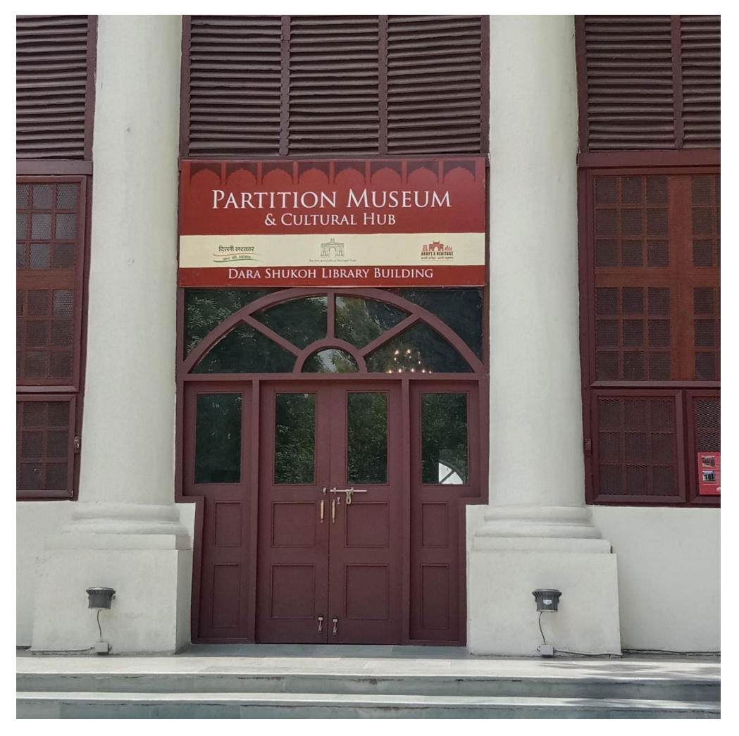
Figure 3. The architectural style of the entrance to the library building contrasts with the Mughal-styled arches, New Delhi.

Dara Shikoh Library is now a part of Delhi's Ambedkar University campus, which is located in Kashmiri Gate, a part of the historic walled city that was built by Shah Jahan, now known as Old Delhi. The Dara Shikoh Library subsumes an important division between two urban orders, namely New (associated with the British imperial capital built in the early 1890s) and Old (reminiscent of the Mughal era that preceded the British period) (Sutton 2018). The juxtaposition of the Partition Museum with the Dara Shikoh Library subsumes another important division: the division between pre- and post-independence political orders. Old Delhi experienced a dramatic shift in demography with independence as approximately 330,000 Muslims left Old Delhi for Pakistan while Hindu refugees came to occupy the Muslim spaces that were left behind (Bhardwaj Datta 2021). Subsuming these divisions, both the Partition Museum and the Dara Shikoh Library serve as spaces that are emblematic of syncretic co-existence, despite the political and social ruptures of the past.