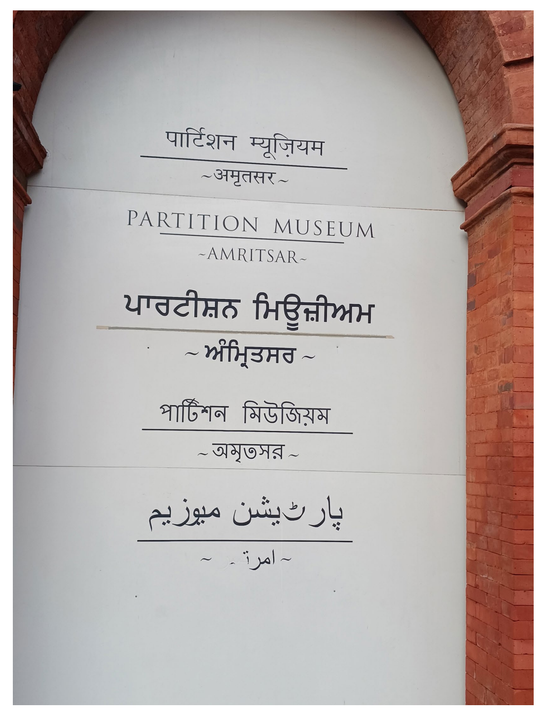
Figure 1. The outer facade of the Partition Museum in Amritsar (photography is not permitted inside the museum), Punjab, 2023.