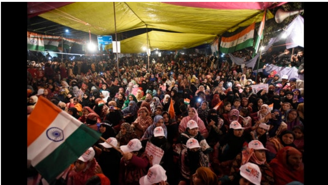
Women protesting against the Citizenship Amendment Act (CAA) and National Register of Citizens (NRC) at Shaheen Bagh, in New Delhi, on Sunday, January 12, 2020.