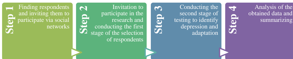
FIGURE 1 GENERAL RESEARCH DESIGN