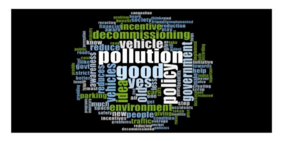
Figure 3: Word Clout of People's Perception of ELV management