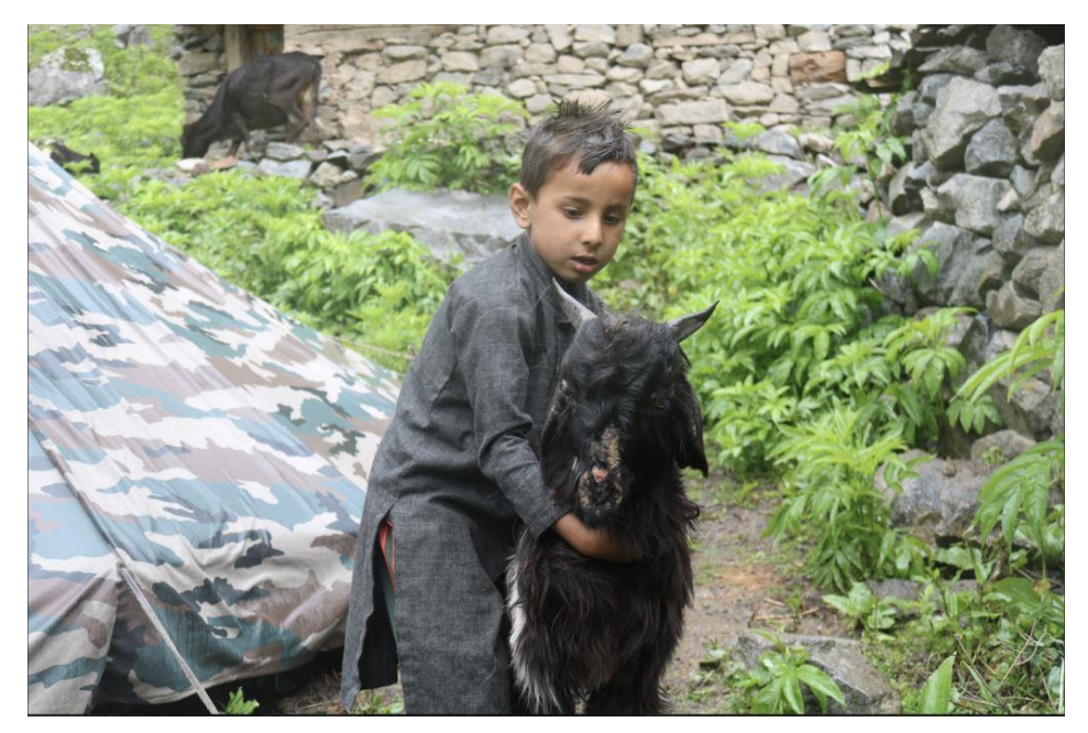
A child from the Bakarwal community.

The Bakarwals are deeply connected to their centuries-old nomadic practice of relying on forests and pastures for their livelihoods. However, the government's current policy on forest preservation fails to protect and ensure the preservation of their traditional lands and access to their traditional pastures. The closure of forests and the appropriation of vital grazing areas have disrupted their way of life, severely impacting their socio-economic conditions.