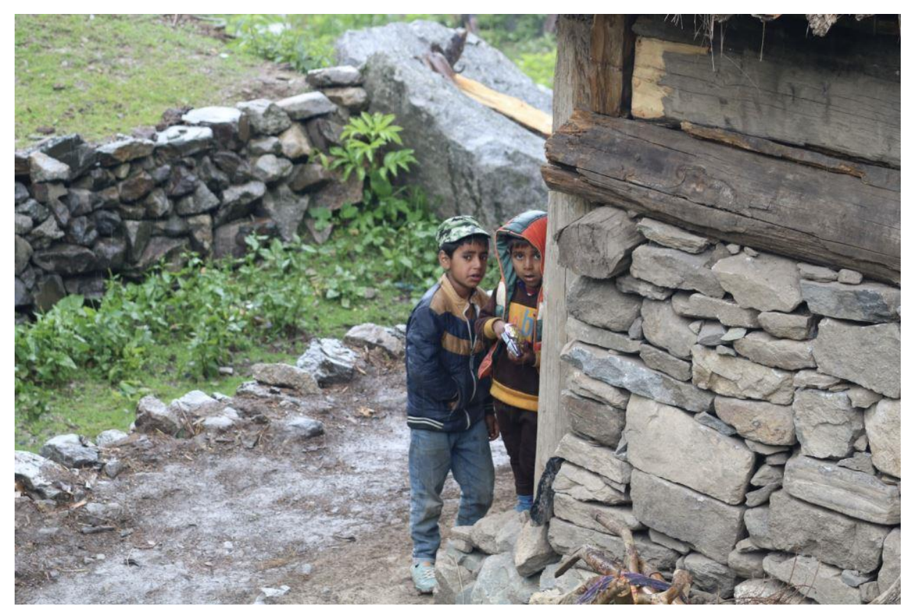
Children from the Bakarwal community.

The educational prospects for the Bakarwals, particularly beyond the high secondary level, are dire. Only a small fraction of students manages to pursue education beyond this stage, and even then, it is primarily restricted to the relatively privileged 'maldar Bakarwals' (rich Bakarwals). The majority of Bakarwal students are unable to access higher education due to a combination of systemic barriers, socio-economic constraints, and limited institutional support.