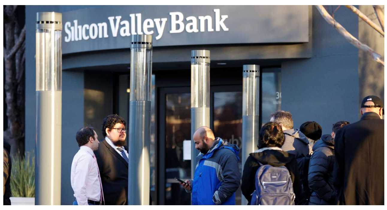
Outside the Silicon Valley Bank headquarters in Santa Clara in California on March 13.

The collapse of the Silicon Valley Bank in America on March 10 is likely to have a global spillover effect on startup companies, especially bigger technology companies that are still under private ownership.