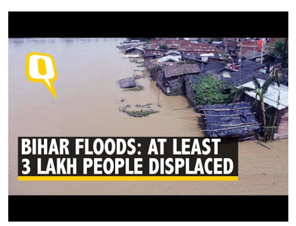
Watch Video At: https://youtu.be/hUMltmeu6M4

Successive governments since independence have tried to address the problem. But even 4000 km of embankments have not been able to tame the rivers of this area. Maybe the embankments are not of sufficient quality, or maybe India just does not have the resources to