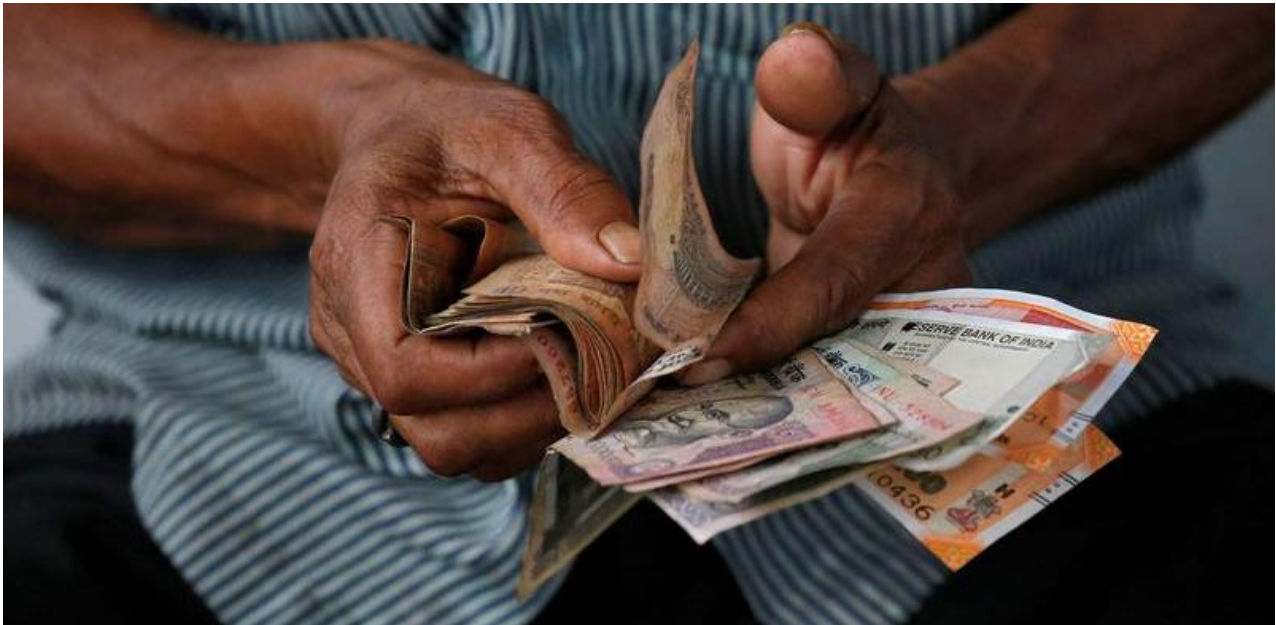
An attendant at a fuel station arranges Indian rupee notes in Kolkata, August 16, 2018.

thewire.in/economy/never-mind-the-dollar-strengthening-a-diving-rupee-is-wrecking-domestic-macroeconomic-stability