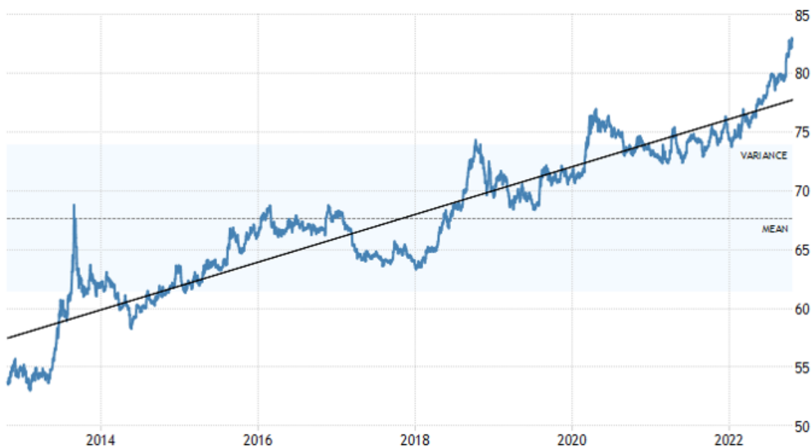
Performance of the Indian rupee over the last 10 years.

Also read: With Inflation and National Debt High, Taxing the Rich Looks Attractive