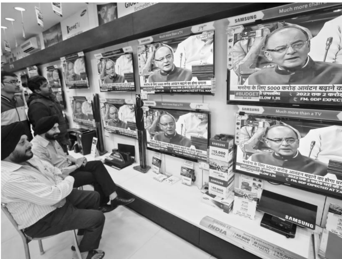
Barring the occasional foreign policy or terrorism-themed panel discussion and live coverage of seminal global events such as the US elections, India's TV channels have not focused on global current affairs.