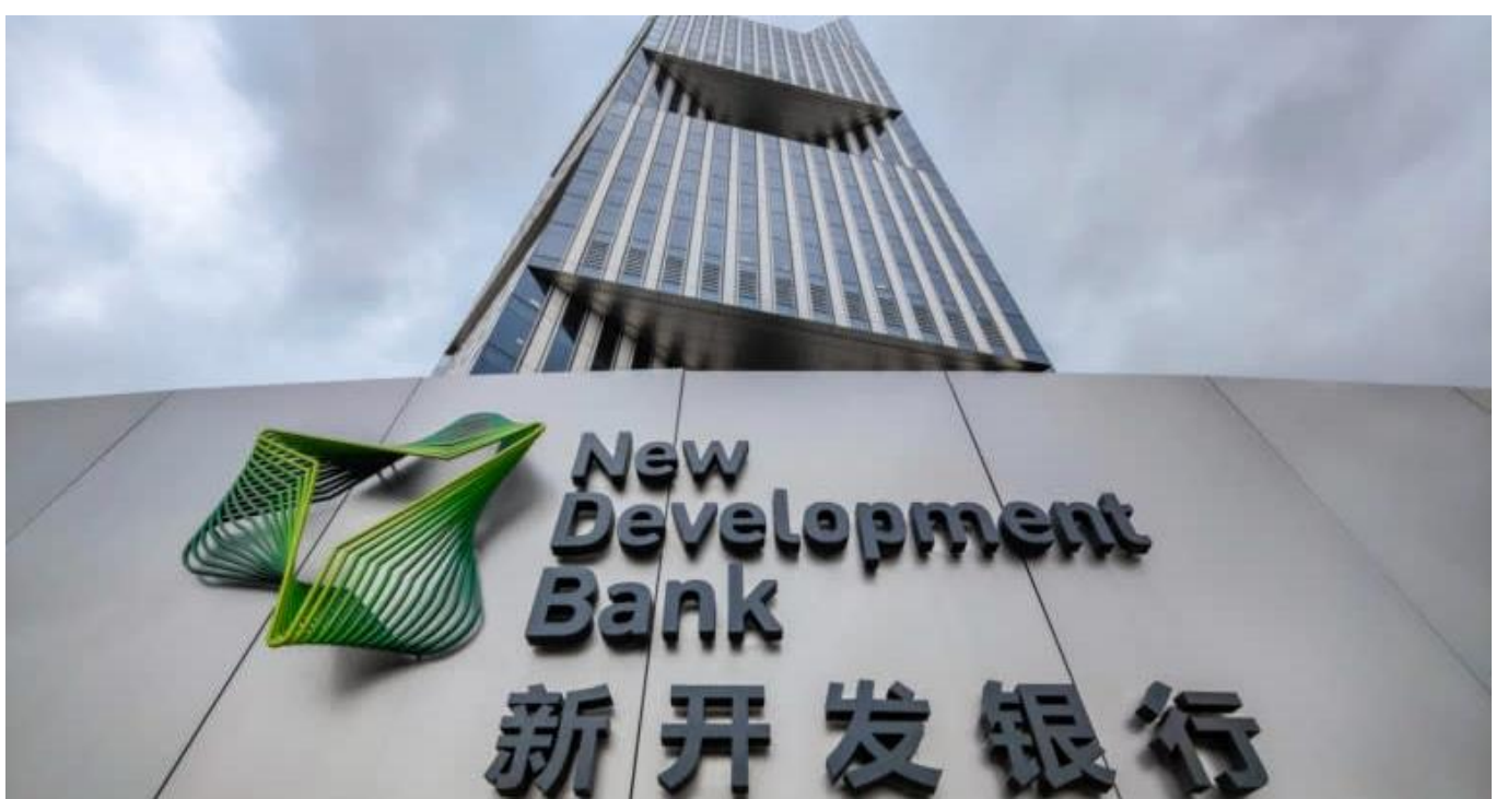
The headquarters of New Development Bank in Shanghai: The bank is equitably structured and not a handmaiden of China.

The institutional design of BRICS over the past 15 years does not permit China to trample over the other four member countries. For example, the New Development Bank established by the BRICS nations, which has disbursed loans of over $25 billion worldwide, is equitably structured and not a handmaiden of China. India thus sees that it can act to internally balance China by playing the BRICS card.