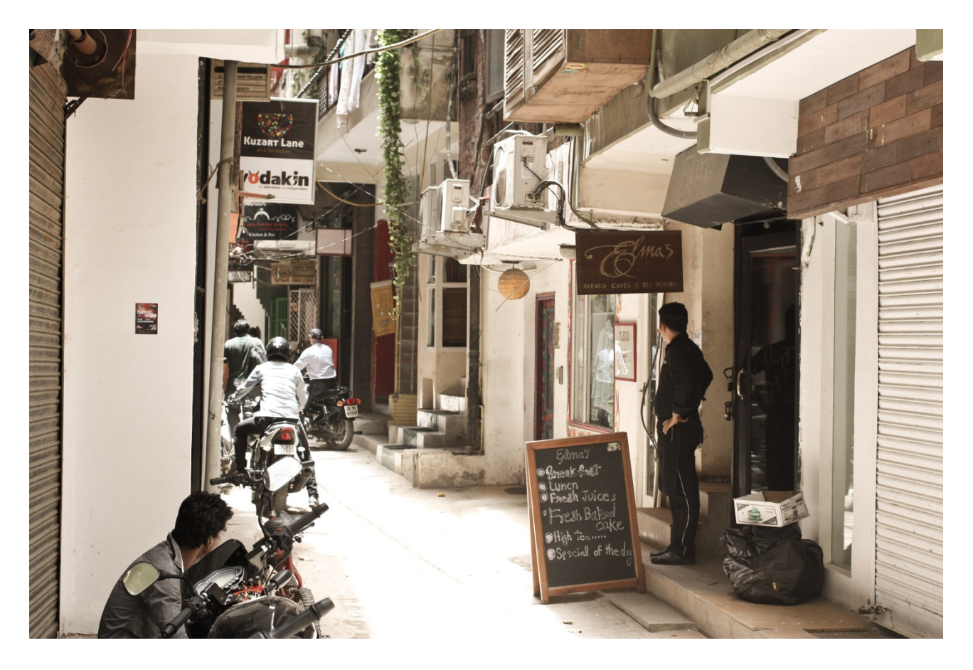
Figure 5: Bikes vs. Pedestrians, Artisan Cafe's and Art Galleries, Hauz Khas Village, New Delhi