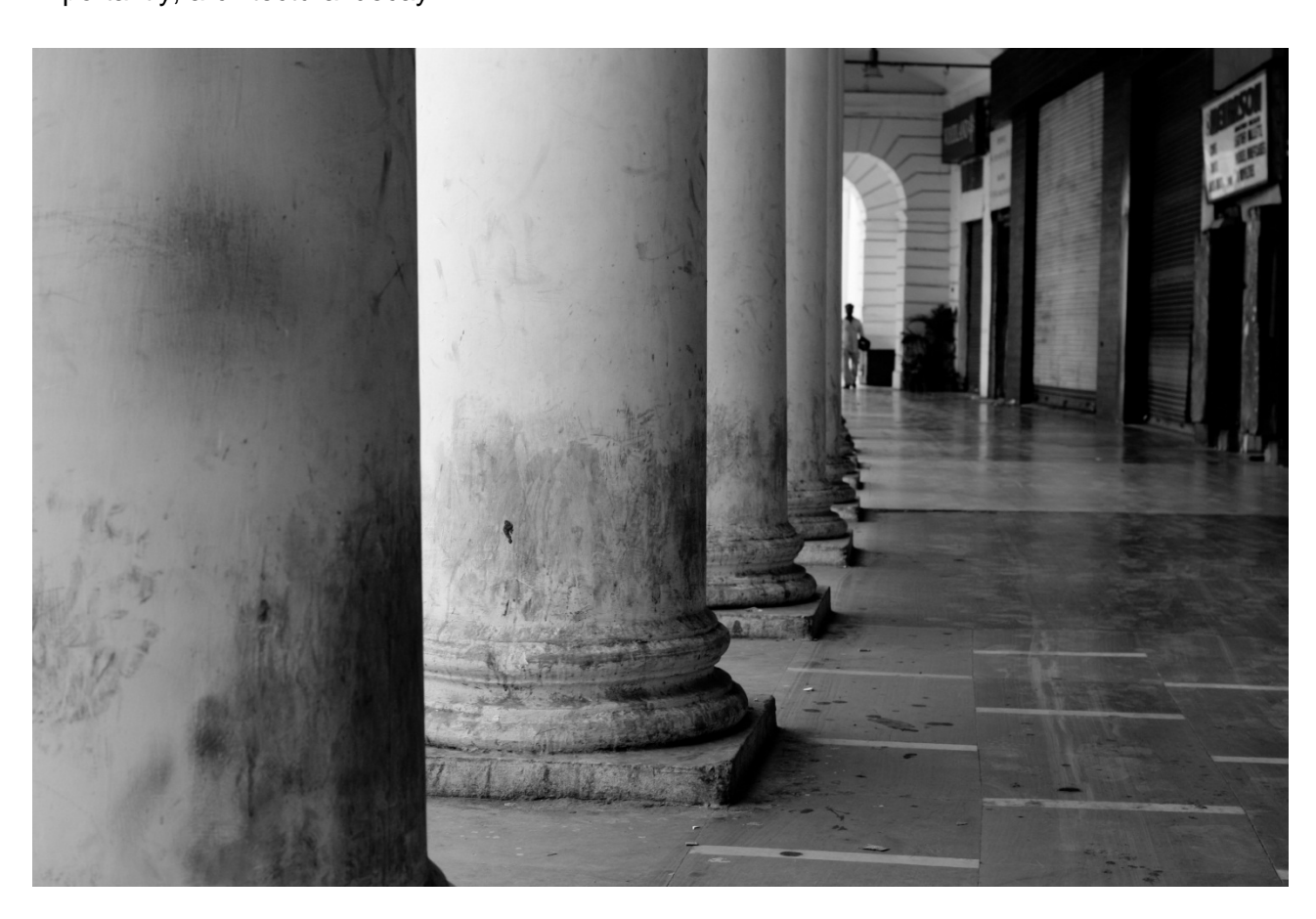
Figure 1: Pillars of the inner circle, Connaught Place, New Delhi

Decay arguably takes the facade of art for it to gain appreciation and life. Art and Politics, as Ranciere often describes, are points that are intricately linked in a "specific space and time" (Ranciere, 2009). Decay in cities like Delhi, often represents and recycles a politics of memory - a memory of the colonial and historical past. Connaught Place in New Delhi, which was established in 1931, is architecturally placed as a circular body with both inner and outer circles with commercial establishments within. I claim this space is in constant battle with the status quo idea of Delhi - it exists some place 'in between' a more historical aesthetic and a modern comprehension of the city. The central Connaught Place area is also not reflective or visually connectable to the Nehruvian imagination of the Corbusier placement (Nehru had advocated and invited Le Corbusier to India for projects in the country (including the city of Chandigarh)). The Connaught Place experience is nevertheless always witness to a process of 'maintenance' and 'civic disregard' of space at the same time. The openness, harsh utilization of its public space and frequent inability of the local administration in its upkeep, results in virtual contradictions and most importantly, architectural decay.