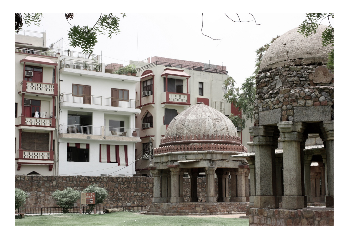
Figure 6: Monuments part of the historical Hauz Khas Complex walled from neighborhood housing providing for a 'contrast', Hauz Khas Village, New Delhi