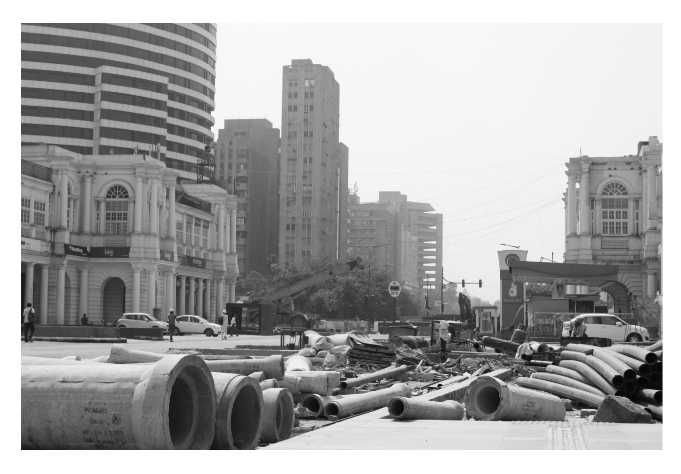
Figure 2: Constant 'development' and maintenance, Connaught Place, New Delhi

The Khan Market of Delhi is an example of a place that represents a public appreciation of 'timelessness' because of its simplicity, 'decay' and proximity to a privileged neighborhood. The Khan Market has often been claimed to be the most expensive retail space in the country but it paradoxically doesn't seem so. The stench of the Monsoon, flooded pot holes, corners of spit, unpainted corridors, dusty walls and a very chaotic parking space are some of the features of this cosy little market place. What makes it exclusive is certainly the posh surroundings and its clientele but most importantly is the 'internalization' of the aesthetic form where the shop takes its independent role of conditioning the customer to be a part of a special space. Here, the ignorance of the sanitized space gives architecture an opportunity to remain what it was when the market was created. Of-course, the 'ad-space' in the market of protruding sign posts might keep changing but the pathways and brick stones seem to remain the same. For architecture to play such a role, the public enforces both carelessness and acceptance of the existing form of the market and therefore, it embraces its being. The possibility of a modern mall to replace this marketplace would arguably be unthinkable for a local Delhi resident. Decay, perhaps here takes an ambitious omnipresent reciprocity in the local imagination, playing with the reflexivity of architecture in its public applicability.