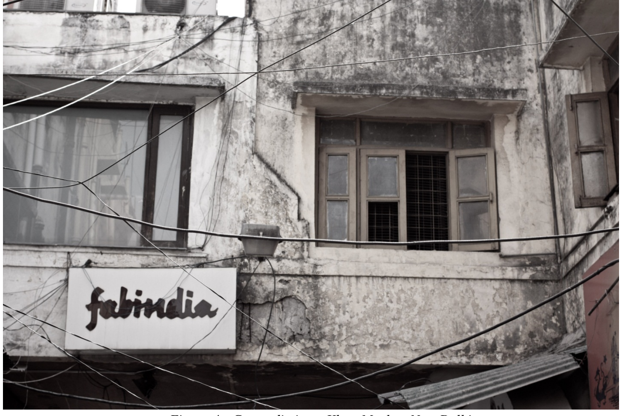
Figure 4: Contradictions, Khan Market, New Delhi