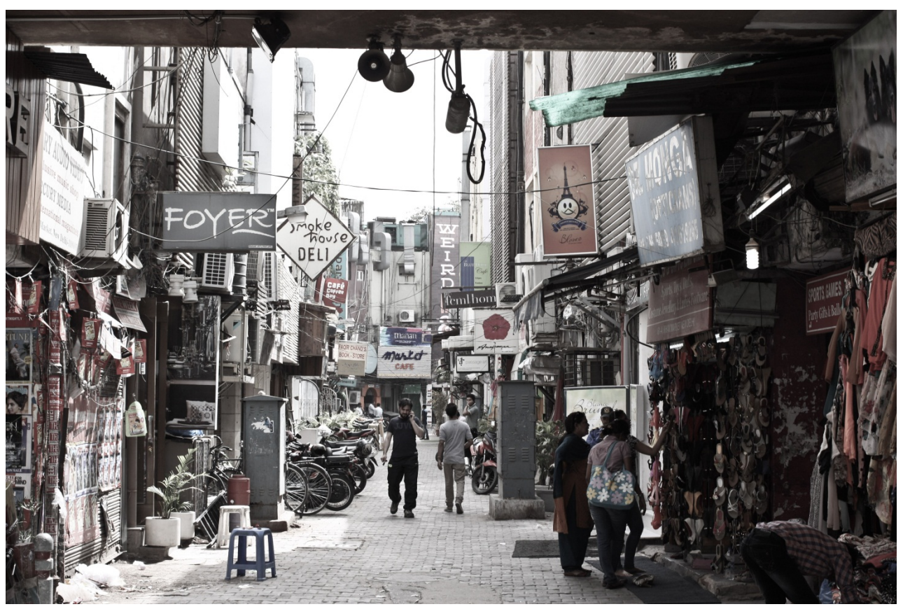
Figure 3: A premier market place? Capitalism and Decay, Khan Market, New Delhi